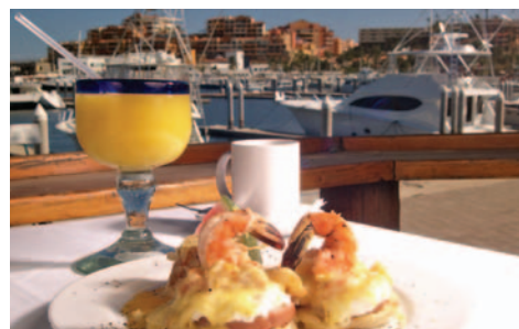
Eggs Benedict with sautéed shrimp at Baja Cantina Dockside.