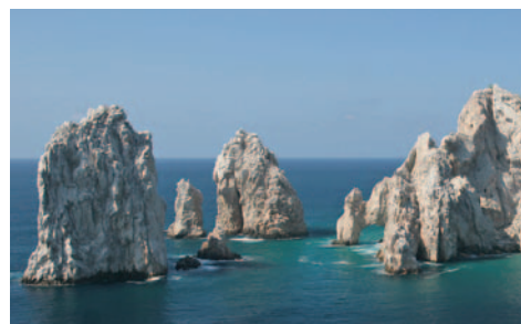
Aerial view of Cabo's landmark Arch at Land's End.